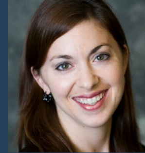
Director, Center on Contemporary India